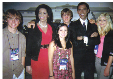
RUBBING ELBOWS: Valley students pose with life-like wax figures of President Barack Obama and the first lady at Madame Tussauds Wax Museum.