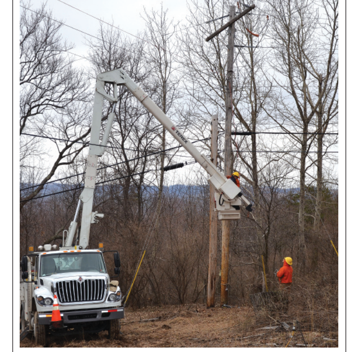
INVESTMENT: Valley REC line crews in April set new poles and string new wire along School House Hollow Road in Henderson Township, Huntingdon County. The upgrade is part of a 2013 work plan project that will continue into the fall. Crews completed the initial work with minimal interruption of service to members.