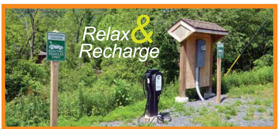
Visitors to Greenwood Furnace State Park, Huntingdon County, can charge their electric vehicles at this station while enjoying the park. A charging station is also available at Cowans Gap State Park, Fulton County. In the fall of 2018, the Pennsylvania Department of Conservation and Natural Resources began an initiative to place EV-charging stations at 40 state park locations. Twenty-three have been installed to date.

Valley REC's selection process begins in October, when school districts are provided Youth Tour applications. The application is also available on Valley's website. The program is open to high school juniors in school districts in which Valley REC has territory. The program is open to students who reside in member and non-member households.