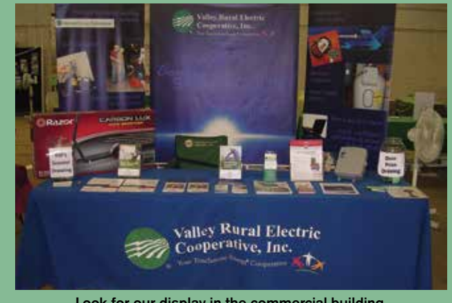
Look for our display in the commercial building.