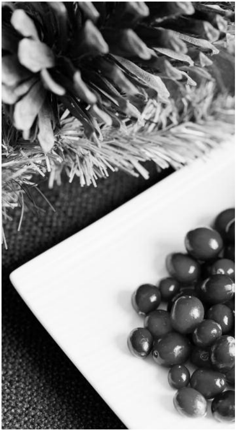
Cranberries are a festive and healthy snack during the holidays. Filling up on fruits and veggies at get-togethers can balance out intake of other party foods.

Most importantly, enjoy yourself by making the focus of the holiday season your family and friends, not food.