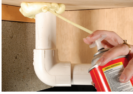
SAVE ENERGY: Expandable foam acts as an insulator, sealing holes around pipes and fixtures.

The following tips offer easy ways to minimize air infiltration in your home.