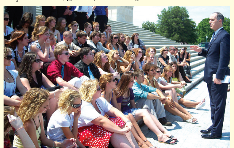
vips: Pennsylvania Sen. Bob Casey Jr. (D) speaks to recent Youth Tour students during their visit to Capitol Hill, a key part of the Youth Tour agenda.

For more details, visit youthtour.coop or call Valley Rural Electric Cooperative at 800/432-0680, extension 163.