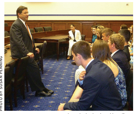
CONGRESSIONAL VISIT: Local students attending the 2011 Rural Electric Youth Tour meet with U.S. Rep. Bill Shuster (R-9th) to discuss current issues affecting rural Pennsylvanians.

The featured speakers during National Youth Day provide insight regarding the important roles electric cooperatives play in their communities and in the nation. Students gain a personal understanding of American history and their responsibility as citizens