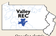
One of 14 electric cooperatives serving Pennsylvania and New Jersey

Valley Rural Electric Cooperative, Inc. 10700 Fairgrounds Road P.O. Box 477 Huntingdon, PA 16652-0477 814/643-2650 1-800-432-0680 www.valleyrec.com