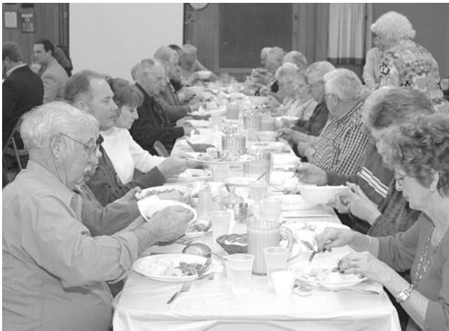
ABOVE: Co-op members and guests from District 2 enjoyed a delicious dinner at their district nominating meeting Feb. 3.

For more information on the candidates nominated this year, see Page 4.