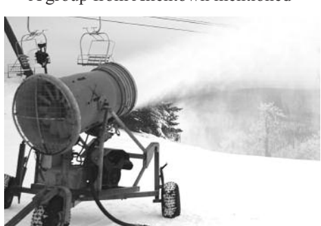
ABOVE: The resort recently increased its snow-making capacity by 30 percent. Future plans include boosting it more by expanding the snow-making pond.

RIGHT: The snow tubing park is now open seven days a week.