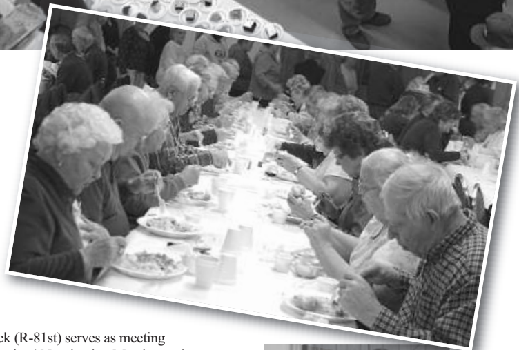
RIGHT: Consumers enjoy a turkey dinner Feb. 9 at the District 6 Nominating Meeting held at Freedom Township Fire Hall.