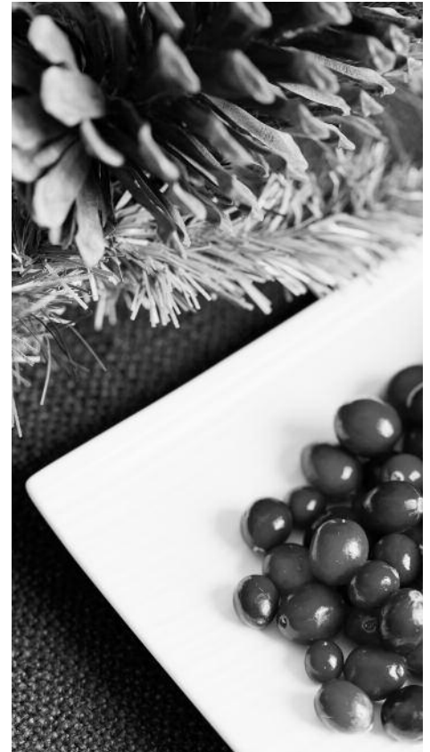
Cranberries are a festive and healthy snack during the holidays. Filling up on fruits and veggies at get-togethers can balance out intake of other party foods.

Most importantly, enjoy yourself by making the focus of the holiday season your family and friends, not food.