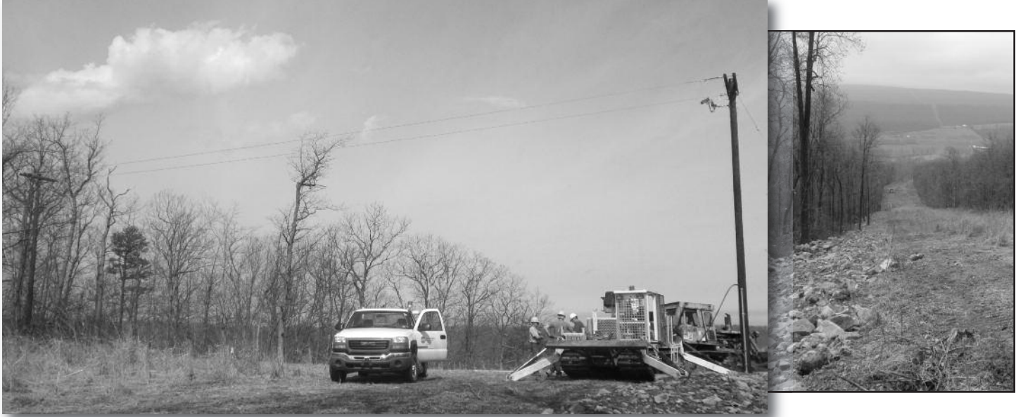
Above: A Valley REC crew erects one span of overhead line near the site of the new Juniata County communications tower in Lack Township in April. The span crosses a natural gas pipeline. Top right: The pipeline cut provides a great view from Blacklog Mountain looking south toward Rt. 35. Right: Boyd Gelvin (left) and Jason Wilson connect underground wiring in a deep well box.

office relied on the radio tower along Route 74 near Ickesburg, but there were areas of Blacklog that were not covered.