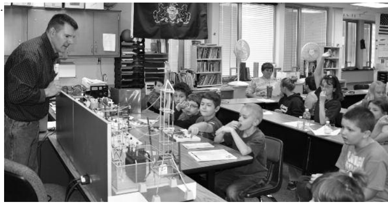
Valley REC offers FREE presentations about electrical safety, energy conservation and environmental issues to schools and civic organizations.