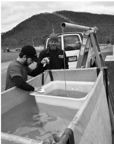
It may seem crazy to mix water and electricity, but placing a bucket liner in a tub of water allows technicians to test the integrity of the liner by measuring current on each side.

Ross says the structural test is important because the boom is used to lift line equipment, such as transformers and switches, as well as the co-op's line personnel.