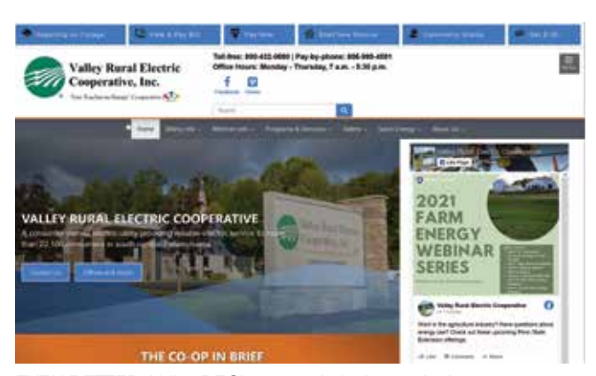
EVEN BETTER: Valley REC's new website keeps the best features from the previous version but includes upgrades that make site navigation more intuitive. Accordion-style presentment of information, such as in the screenshot below, allow site visitors to see lists of topics and then click to see more information.

Award judges have praised our previous site for being easy to use with important and timely information easily available. Our new design strives to maintain those qualities. Prominent buttons across the top provide