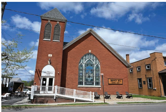
ALL ARE WELCOME: Honey B's Coffee Shop is in the former church at 202 S. Market St., Martinsburg, Blair County.